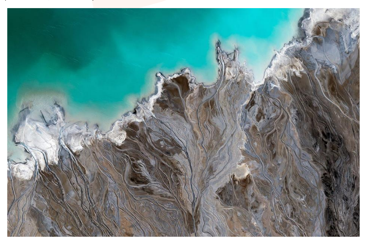
Kacper Kowalski, Toxic Beauty