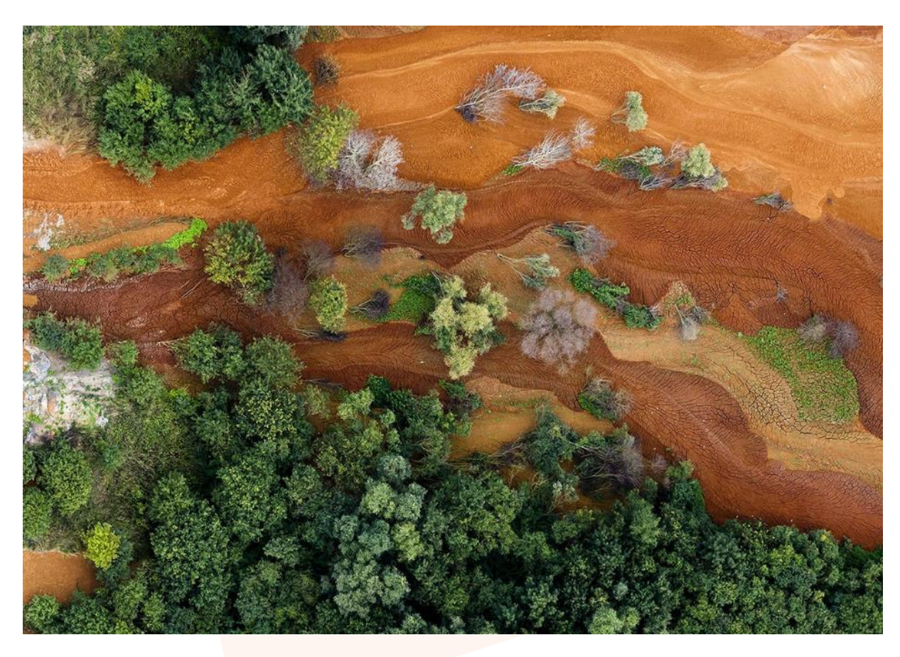
Kacper Kowalski, Toxic Beauty