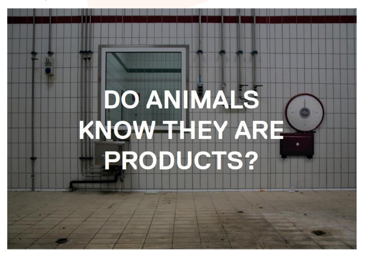
Igor Grubić – Do animals...?